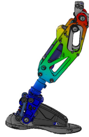
High performance artificial foot/leg analysis